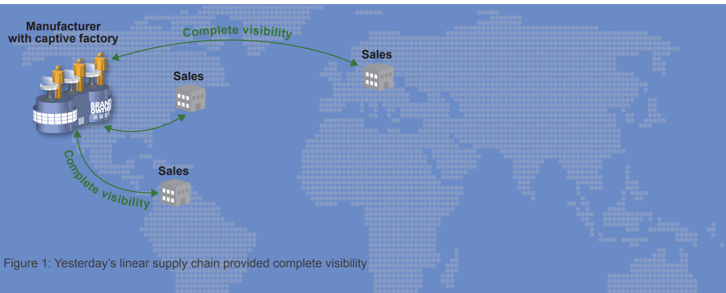
Figure 1: Yesterday's linear supply chain provided complete visibility

This persistent shift to overseas manufacturing has especially affected the production of consumer electronics. McKinsey Quarterly confirms that “the production of high-tech goods has moved steadily from the United States to Asia over the past decade.” 2